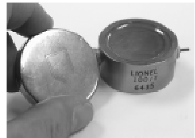
Figure 4. Lionel miniature pancake-type GM detector. Originally made by Anton, the cover is stamped with the Anton shield but with "Lionel" replacing "Anton."