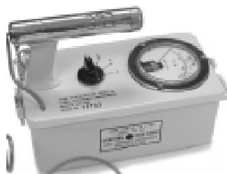
Figure 1. Lionel Electronic Laboratories (LEL) model 6b CDV-700 Geiger survey meter. This is LEL's most successful product. About 82,000 were sold to the Office of Civil Defense. Many are being retained and recycled for use by homeland security radiological emergency response teams.

Perhaps the most unusual LEL product made for the civil defense