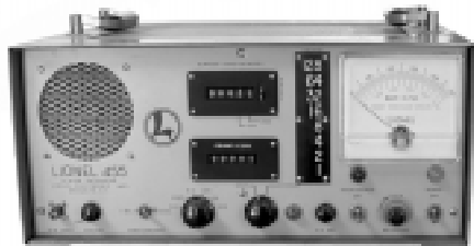
Figure 3. Lionel model 455 laboratory bench monitor scaler. This was first advertised in 1963, a time when decade scalars were beginning to replace the binary system used in the 455.

In contrast to its civil defense products, surviving examples of LEL commercial nuclear products, especially the larger pieces, are infrequently found. A survivor in mint condition is a model 455 bench monitor in the Oak Ridge Associated Universities (ORAU) health physics collection (Figure 3). Smaller pieces, such as detector tubes, are somewhat easier to find. A pancake (flat) Geiger tube originally made by